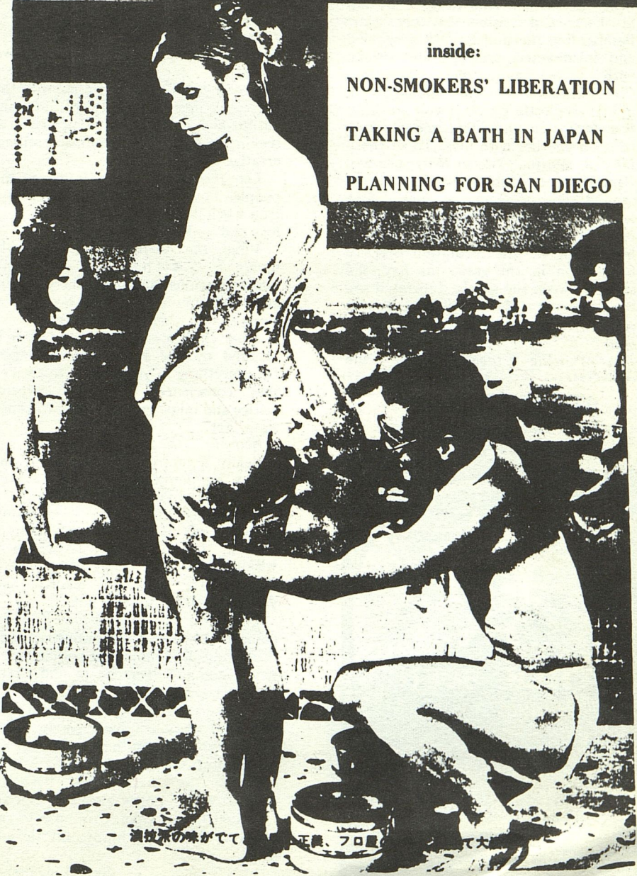
演技家の味がでて 正義、フロロ いて大